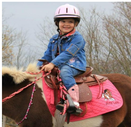
An up and coming Junior Rider!!